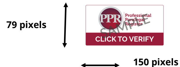
Size Option 2 79 pixels high by 150 pixels wide

<div style="max-width:150px;max-height:79px;"><div style="position: relative;padding-bottom: 52.8%;height: auto;overflow: hidden;"><iframe frameborder="0" scrolling="no" allowTransparency="true" src="https://cdn.yoshki.com/iframe/55055r.html" style="border:0px; margin:0px; padding:0px; backgroundColor:transparent; top:0px; left:0px; width:100%; height:100%; position: absolute;"></iframe></div></div>