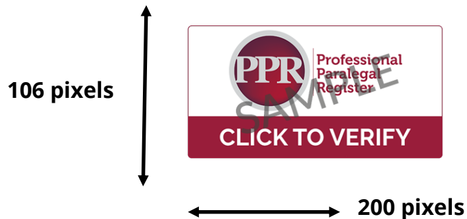
Size Option 1 106 pixels high by 200 pixels wide

<div style="max-width:200px;max-height:106px;"><div style="position: relative;padding-bottom: 52.8%;height: auto;overflow: hidden;"><iframe frameborder="0" scrolling="no" allowTransparency="true" src="https://cdn.yoshki.com/iframe/55055r.html" style="border:0px; margin:0px; padding:0px; backgroundColor:transparent; top:0px; left:0px; width:100%; height:100%; position: absolute;"></iframe></div></div>